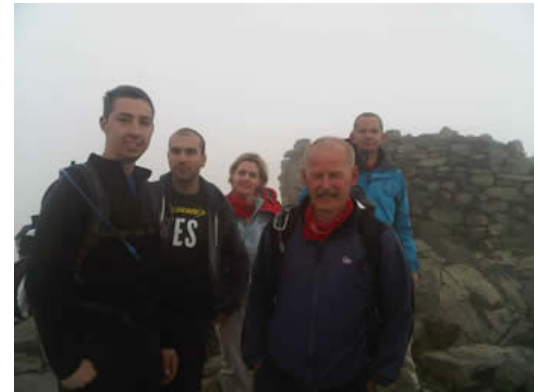
Some of the team at the summit of Scafell Pike

You can read the team's daily updates from the challenge at our website, www.childoc.org.uk