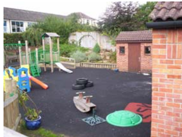
Before.....see inside for after!