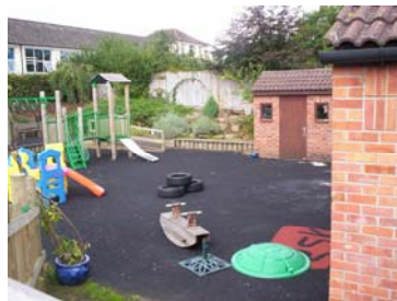
Before.....see inside for after!