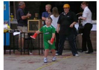
Welly Wanging at the Fun Day!