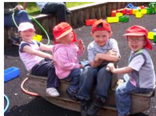
Enjoying the sun at Summer Playscheme

If you have some news that you would like to share, please contact us and it may be included in the next issue of Opportunities. You may have some feedback on a featured item, or a birthday or an event to tell us about. Remember, we welcome your comments!