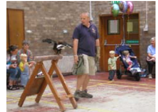
Birds of Prey at the Fun Day